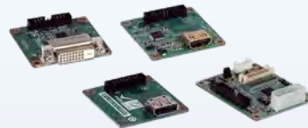
iDP converter cards with brackets