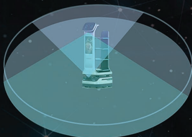
Ultra wide detection angle