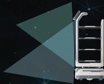
Ultra wide 3D detection scope