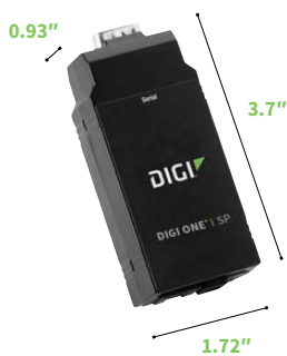
DigiOne® SP - FRONT

For a full list of accessories, visit www.digi.com